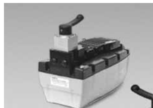
Air/oil manual pump