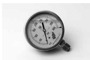
Pressure - gauge