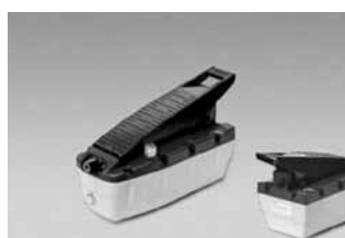
Air/oil foot pump